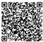
Agrozen Laboratory Authenticity QR Code